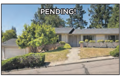
42 Fieldbrook Place, Moraga Offered at $1,035,000 | 5 Offers