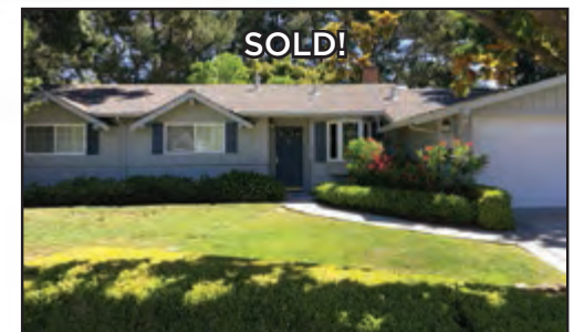
111 Ardith Drive, Orinda Sold for $1,450,000 | Represented the Buyer