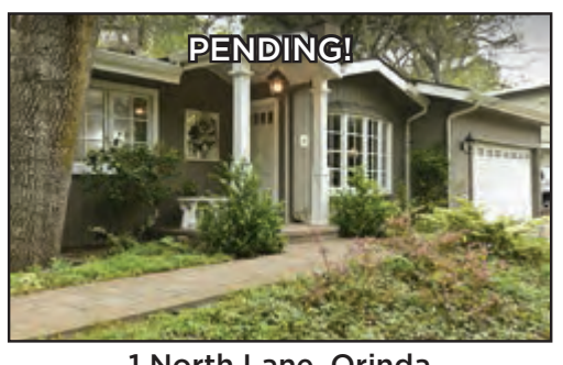
1 North Lane, Orinda Offered at $949,500