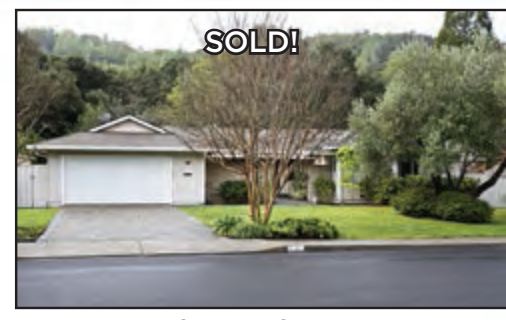
1236 Rimer Drive, Moraga Sold for $1,150,000